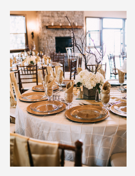
Table inen Colors